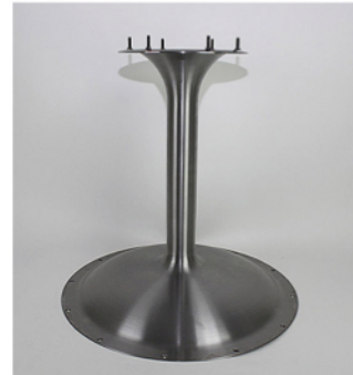
Heavy duty table column end table column, three piece welded construction polished seamless with welded studs. 25" diameter X 39" height x .075" thick steel.